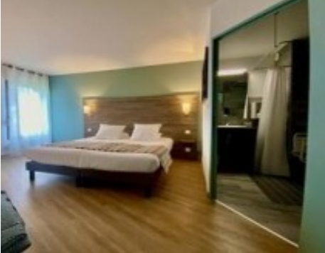
* Example of the type of accommodation