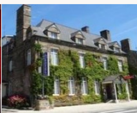
* Example of the type of accommodation