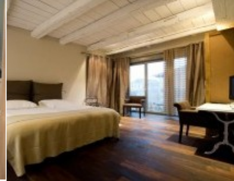
* Example of the type of accommodation