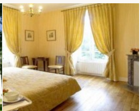
* Example of the type of accommodation