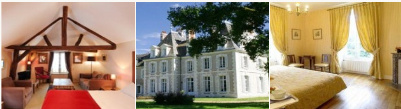
* Example of the type of accommodation

You'll have a wider selection of accommodations when you choosing this 3/4-Star category. Some nights you'll stay in quaint hotels, and other times you might be in a charming Bed and Breakfast. Enjoy the "vie de chateau" atmosphere in an exceptional environment. Properties are selected for their high standards and impeccable service. Don't forget...breakfast is included!