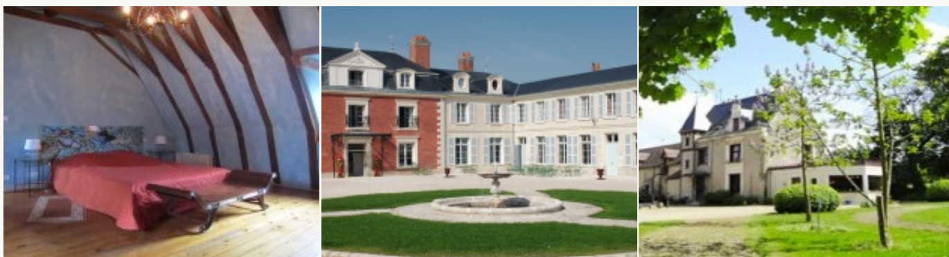
* Example of the type of accommodation

You'll get a good night's sleep when you stay in these 3-Star hotels or Bed and Breakfasts. All properties have been selected for their cleanliness, style and friendliness of the staff. A hearty breakfast is included!