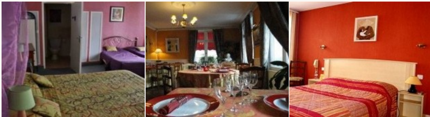
* Example of the type of accommodation