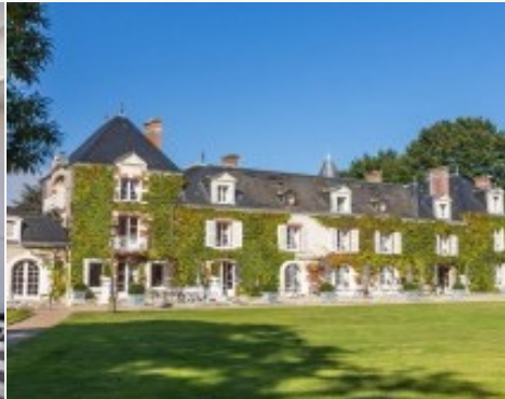
* Example of the type of accommodation